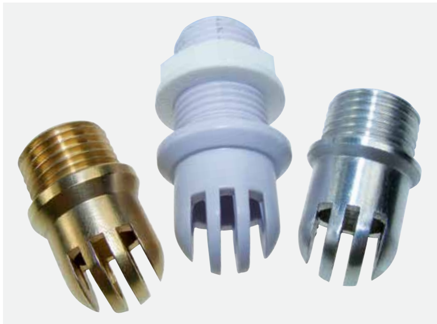
Thimble sensors in stainless steel, brass and white plastic