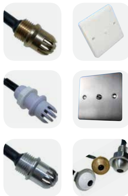
Button sensor options